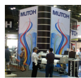
Trade Show Displays